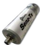
SENZTX Oxygen Transmitter