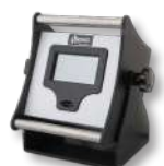
GazTrak Portable oxygen & moisture measurement