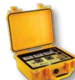
Yellow Box Portable O 2 Analyser