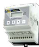
Microx Oxygen Analyser