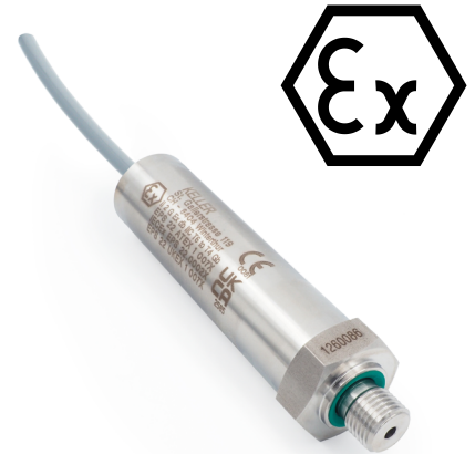
Series 23-Ed Series 33X-Ed

T4: -40\text{ °C} \leq T_a \leq +100\text{ °C} , T5: -40\text{ °C} \leq T_a \leq +95\text{ °C} , T6: -40\text{ °C} \leq T_a \leq +80\text{ °C}