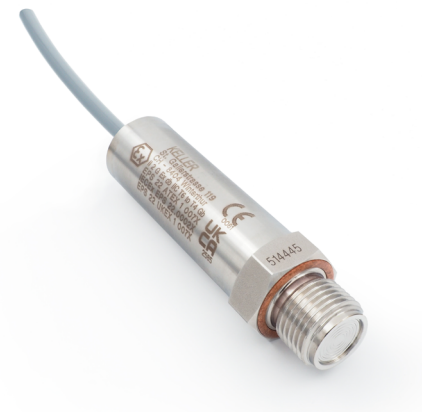
Series 25-Ed Series 35X-Ed